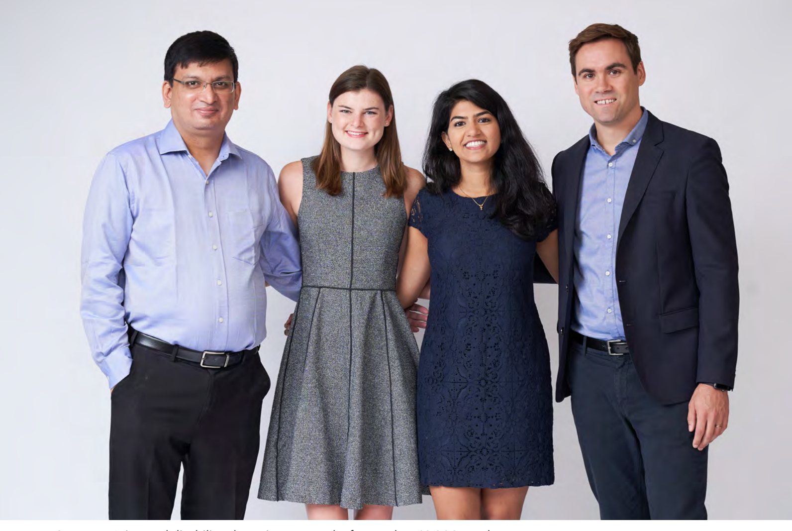
Accenture's internal disability champions network of more than 16,000 employees worldwide helps colleagues feel included at work.